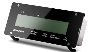
ITC-S2 customer display