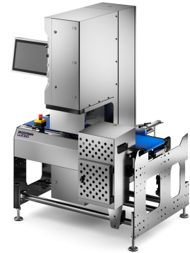
LabelSecure G2 L - Stand-alone

LabelSecure is compatible with numerous packaging types and can be used for a great number of tasks.